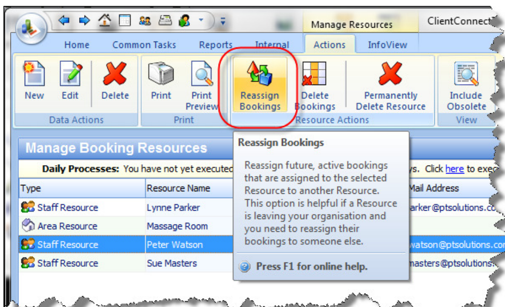
March fig 1.

Go to Application Menu > Control Panel > Manage Booking Resources and highlight the trainer with the bookings you wish to re-assign.